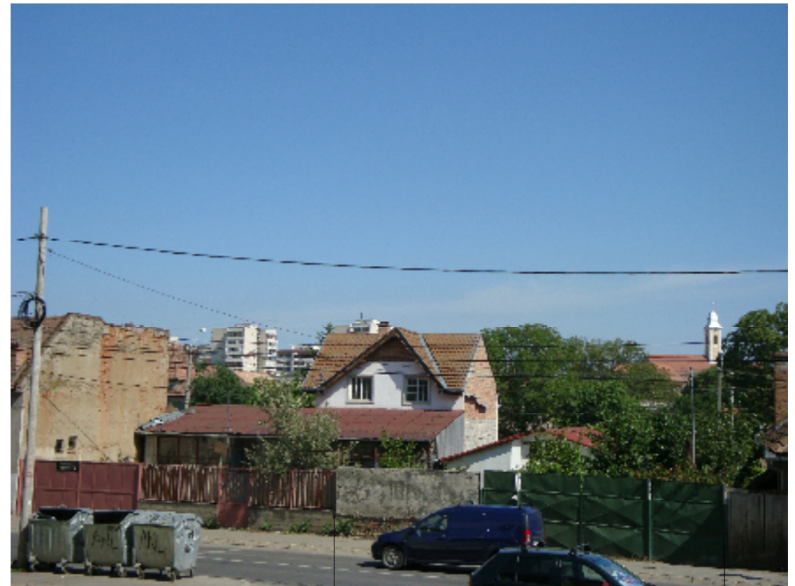
LIMITA PROPRIETATE STR. PREDEAL