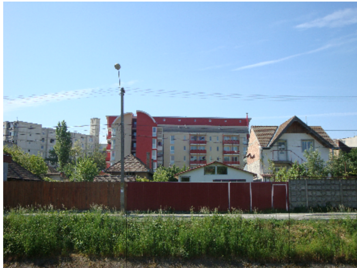
LIMITA PROPRIETATE STR. TUDOR VLADIMIRESCU