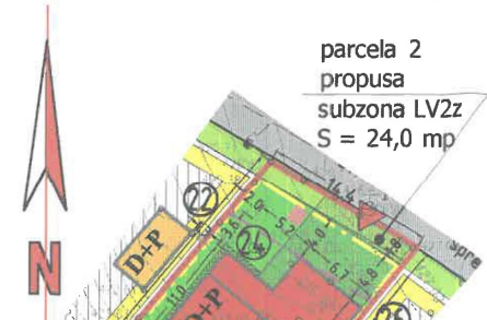
DETALIU DE MOBILARE PARCELA STUDIATA SC. 1:500